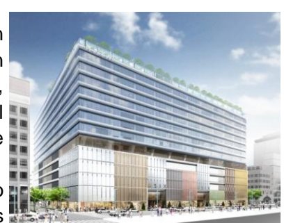
GINZA SIX Exterior image

Inspired by the idea that "architecture should be a medium that allows the subject to shine", the design as a whole, including the facades, has been kept as simple as possible in order to bring attention to the individual store designs, or "blossoming flowers." As for literal flowers, the relatively sparse alcoves will be decorated with scrolls and flower arrangements befitting the season, so that visitors can enjoy the changes of the seasons, a central part of traditional Japanese culture.