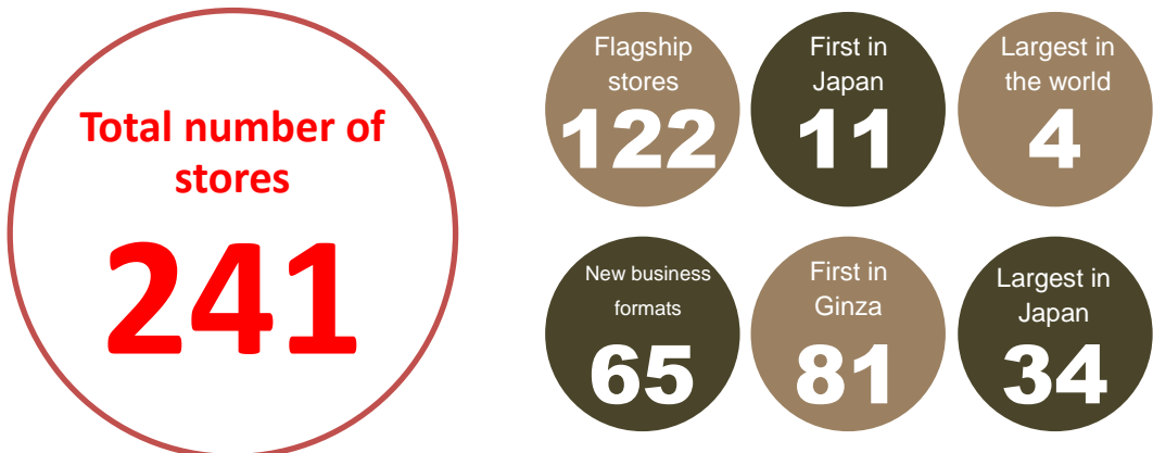
*See "Appendix" for a complete list of stores

Precisely because this is an age where goods are bought online, we feel that the tangible space of GINZA SIX, which allows customers to experience unique spaces and services will produce value. Staking the Ginza area's reputation and the pride of the flagship stores, they can freely display their brand philosophies and worldviews and rise with GINZA SIX to develop and meet various challenges.