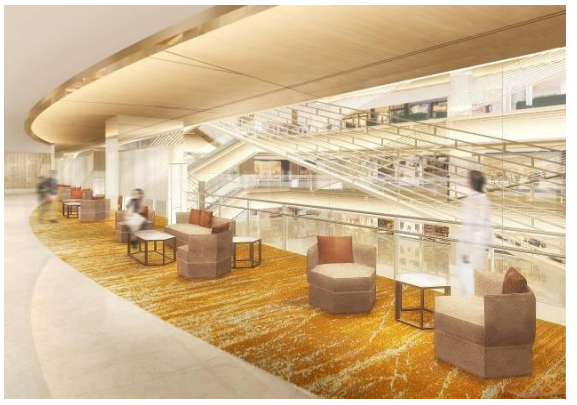
Central open ceiling space (artist's impression)