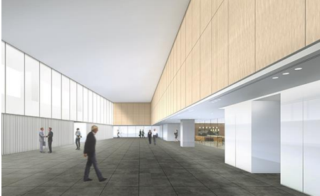
Office Sky Lobby image

The upper floors of the facility house seven office levels with a total office floor space of around 38,000 square meters. The single-floor rental area (standard floor) is largest in Tokyo, at around 6,100 square meters. With its view down onto Chuo Street and 100-meter-plus floor plate, this top-class office environment will accommodate around 3,000 office workers in the center of Ginza.