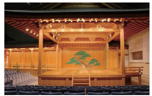
* Differs from actual theater

This 480-seat, 1,600 square meter theater will serve as the base for the Kanze school, the largest in Japan's Noh theater tradition. The theater is intended as a beacon of Japanese traditional culture that heightens Ginza's presence as an international tourist destination. It will also be open to the local community as an event venue. In the event of a disaster, it can serve as temporary accommodation for stranded commuters.