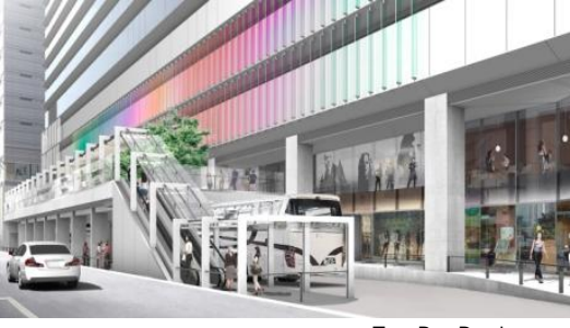
Tour Bus Bay image