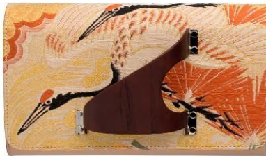
PERRIN [2F] KIMONO CLUTCH BAG 166,000 JPY