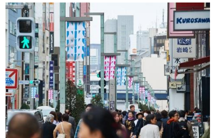
*Image « Following the triangles: a work in situ for GINZA Chuo Street, Tokyo 2018 » © DB - ADAGP, Paris & JASPAR, Tokyo, 2018 G1226

Title: « Following the triangles: a work in situ for GINZA Chuo Street, Tokyo 2018 » Venue: Ginza Chuo-dori Event schedule: April 2 to May 6 (tentative)