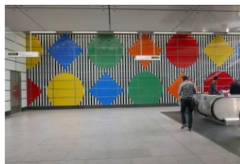
« Diamonds and Circles, works in situ » Permanent installation, Tottenham Court Road Station, London, England. 2008–2017 © DB-ADAGP Paris & JASPAR, Tokyo, 2018 G1226