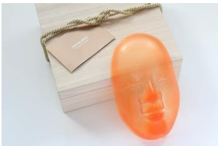
PAPABUBBLE [B2F] Candy Noh mask in Pawlonia wooden box 4,630 JPY