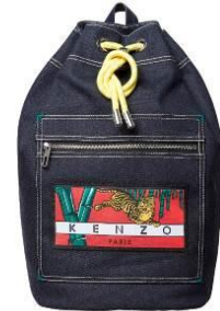
KENZO [3F] Memento N°2 mini backpack 36,000 JPY