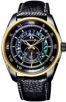
CITIZEN FLAGSHIP STORE TOKYO [1F] Campanola mechanical collection GSIX limited edition 1,250,000 JPY