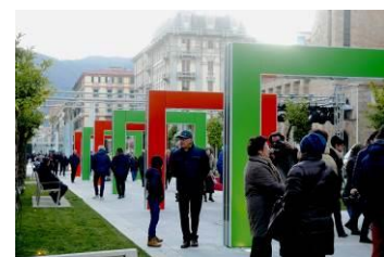
« Archi » Exhibition scenery, Permanent installation, Piazza Verdi, La Spezia, Italy. 2016 © DB-ADAGP Paris & JASPAR, Tokyo, 2018 G1226