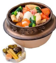
Oginoya [B2F] GINZA SIX 1 st Anniversary Kamameshi "Sho" 3,900 JPY