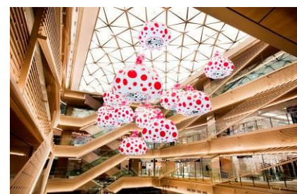
Yayoi Kusama “Kabocha” ©YAYOI KUSAMA

The exhibition of “Kabocha” (Pumpkin) by avant-garde artist Yayoi Kusama has been extended to March 21, 2018. This opening installation has been widely popular as artwork symbolizing GINZA SIX since its opening.