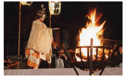
*The above photograph is a stock image of Takigi Noh. Actual performances may differ.

Note: Detailed information on conditions for participation and other aspects will be provided on the GINZA SIX website at a later date.