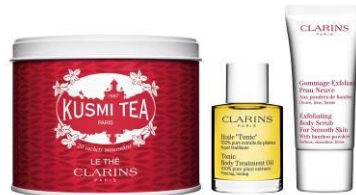
CLARINS [B1F] Tea and skin care set 6,500 JPY