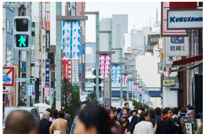
Artwork linked to the new installations in the GINZA SIX central atrium will be displayed along the 1,100-meter length of Ginza Chuo-dori. (Image)

« Like a flock of starlings: Work in situ » Daniel Buren 2018 G1226