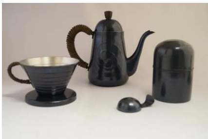
Gyokusendo [4F] Coffee carafe (700 ml) 170,000 JPY Coffee jar (100 g) with spoon 60,000 JPY Coffee dripper 35,000 JPY