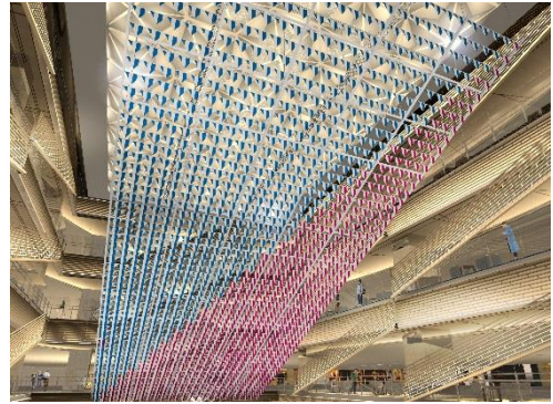
*Image « Like a flock of starlings: Work in situ » Daniel Buren 2018 © DB - ADAGP, Paris & JASPAR, Tokyo, 2018 G1226

Title: « Like a flock of starlings: Work in situ » Daniel Buren 2018 Size: approx. 9 meters × 19 meters Venue: GINZA SIX 2F central atrium Schedule: April 2 to October 31 (tentative)