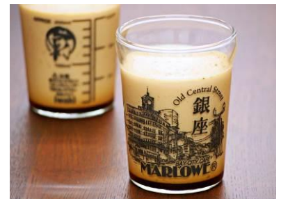
Marlowe [B2F] Ginza store limited-edition pudding in beaker 800 JPY

Note: All prices displayed are exclusive of tax.