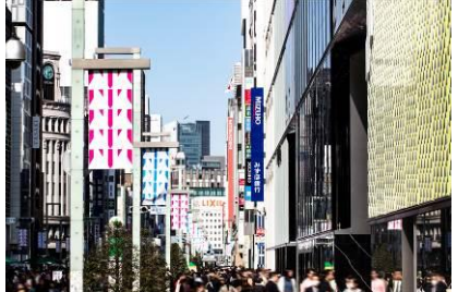
Daniel Buren Following the triangles: a work in situ for GINZA Chuo Street, Tokyo 2018 © DB - ADAGP, Paris & JASPAR, Tokyo, 2018 G1226