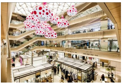
"Pumpkins" - Yayoi Kusama @YAYOI KUSAMA

As one of Tokyo's newest centers for cultural dissemination, we present art programs designed to stimulate the senses. A work titled "Pumpkins" by avant-garde artist Yayoi Kusama has been on display in the facility's central atrium, drawing significant attention. since opening day. Installations like the 12 m-high living wall produced by Teamlab and Patric Blanc and a permanent exhibition of public art from popular Japanese and international artists provide opportunities for people to engage with art at various locations throughout the facility. GINZA SIX has also gained a reputation as a place of photogenic spaces and experiences. More than 280,000 items on GINZA 6 have been posted on Instagram and other social media. Since Monday, April 2, 2018, as the facility enters its second phase as a Ginza art space, a new work has been on display in the atrium. The baton has now passed to French artist Daniel Buren. The facility has also pursued initiatives designed to achieve cultural dissemination in harmony with the streets of Ginza. Examples include the flags displayed along Ginza's Chuo-dori Street and the art jacks found on the GINZA SIX facade. (See p. 8 for more information.) A special GINZA SIX video featuring a duet by singers Ringo Shiina and Tortoise Matsumoto about the Ginza district has drawn both attention and praise since the GINZA SIX opening. Called "Main Street," the song was penned by Shiina. It's become a new theme song for the ever-evolving Ginza area.