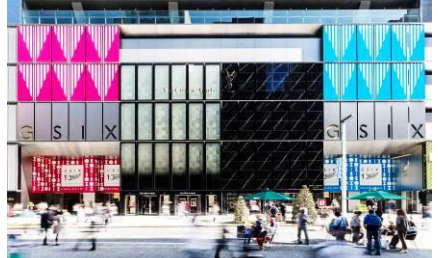
Daniel Buren Triangles for the entrance of GINZA SIX work in situ

© DB - ADAGP, Paris & JASPAR, Tokyo, 2018 G1226